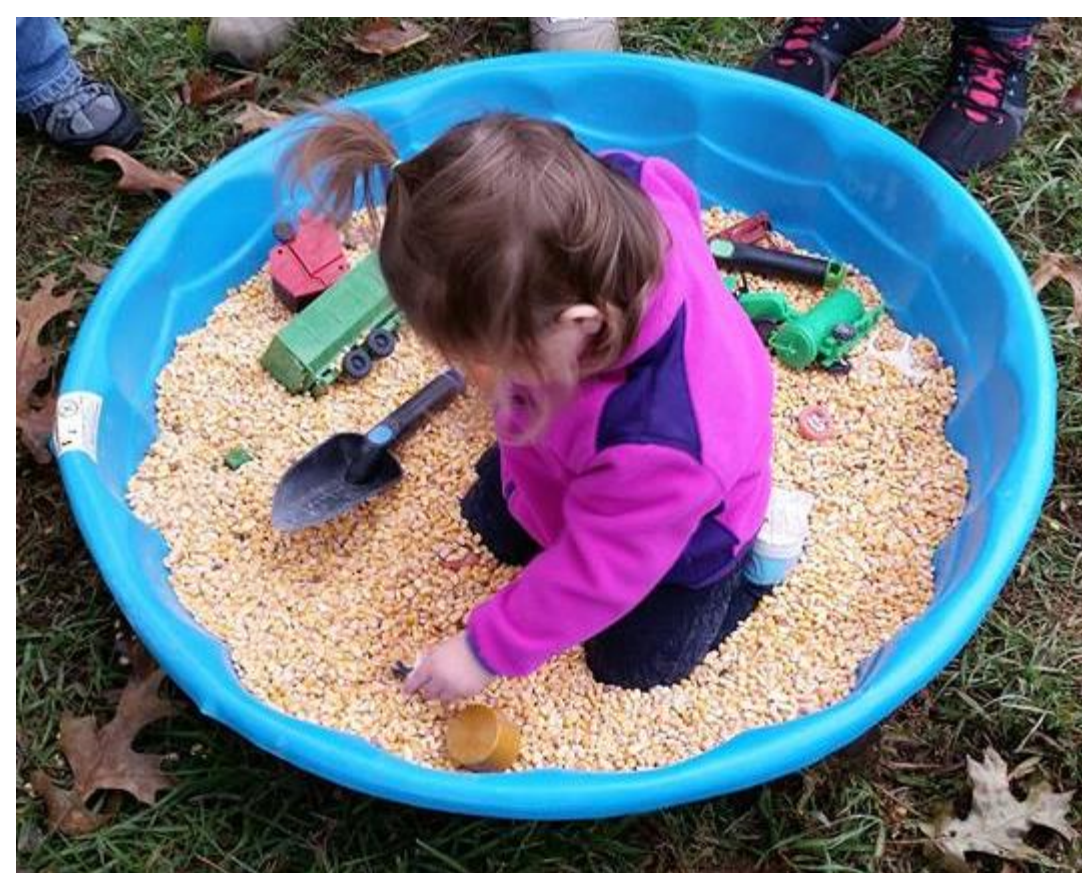
Agritourism examples: Top Picture- Sensory bin at a farm field trip.