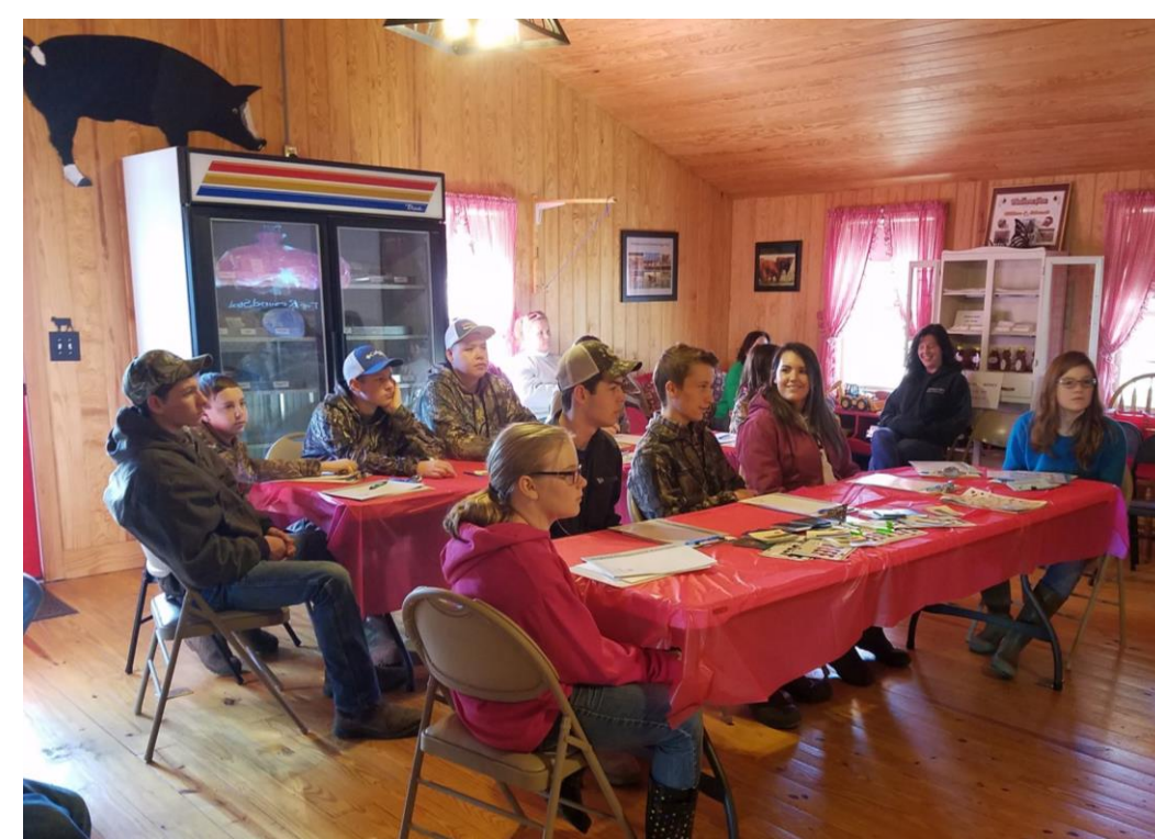
Bottom picture- Meat educational workshop at a local farm market.